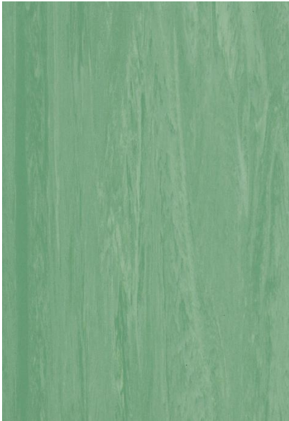
GFD 81119 [Stock] Cedar Green