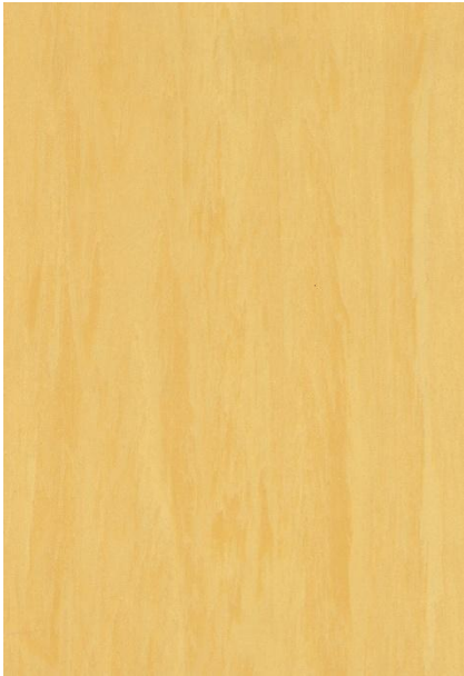
GFD 81101 [Stock] Dorset Gold