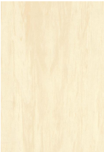
GFD 81104 [Stock] Lambskin