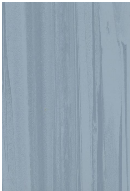
GFD 81123 [Stock] Oxford Gray