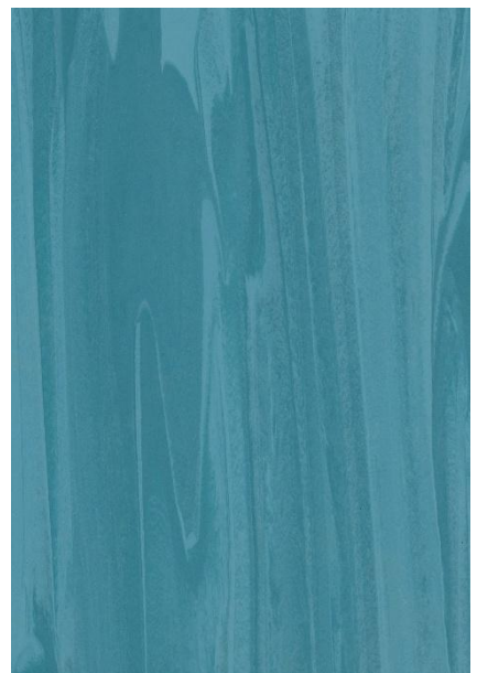
GFD 81124 [Stock] Whipple Blue