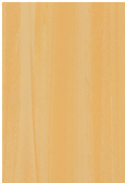
GFD 81109 [Stock] Golden Mist