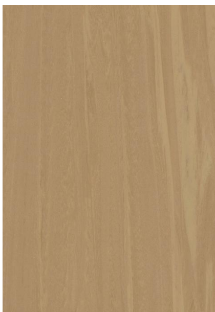
GFD 81110 [Stock] Vally Forge Brown