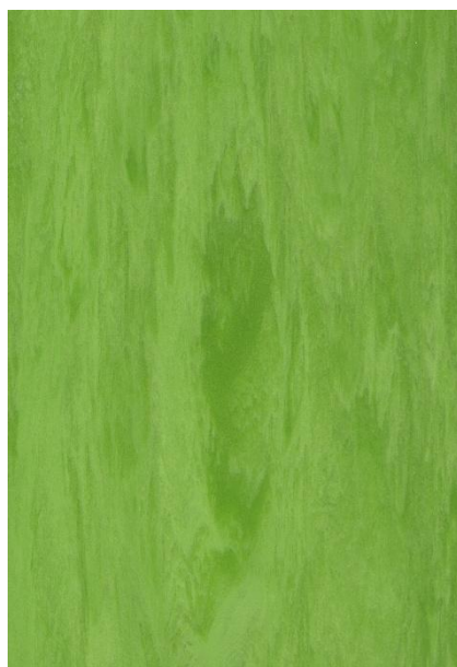
GFD 81118 [Stock] Rosemary Green