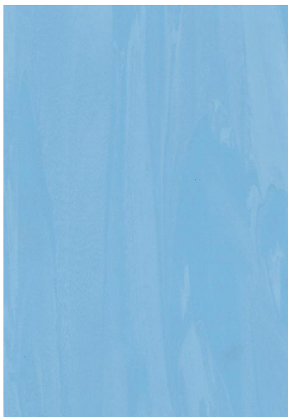
GFD 81107 [Stock] Tidal Wave