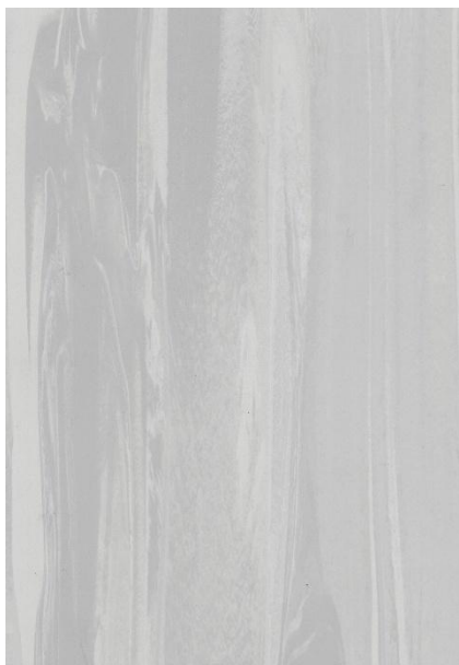
GFD 81113 [Stock] Gray Owl