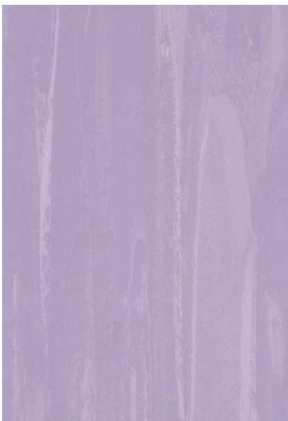
GFD 81122 [Stock] Lily Lavender