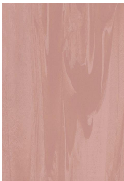
GFD 81112 [Stock] Antique Rose