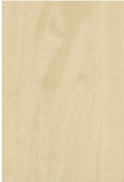
GFD 81102 [Stock] Putnam Ivory