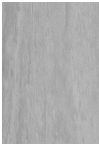
GFD 81115 [Stock] Gull Wing Gray