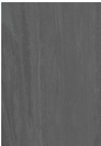
GFD 81116 [Stock] Deep Space