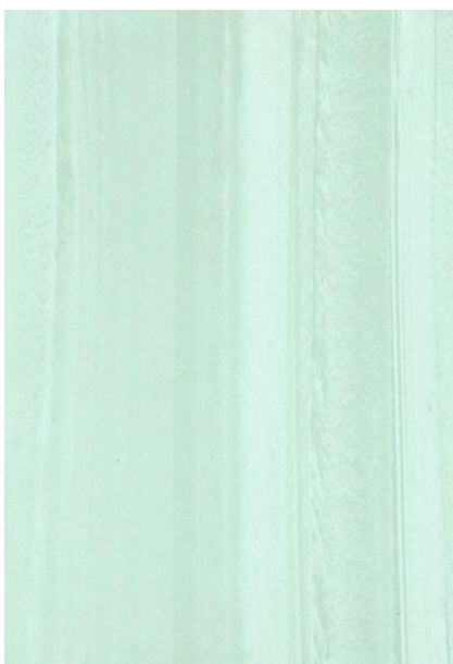
GFD 81117 [Stock] Leisure Green