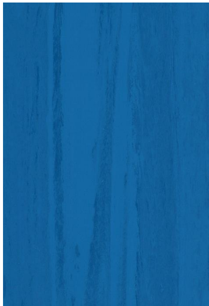
GFD 81105 [Stock] Dark Royal Blue