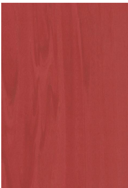
GFD 81111 [Stock] Mexicana