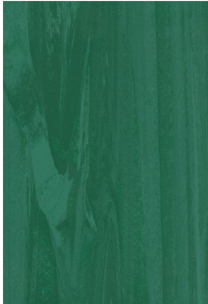
GFD 81120 [Stock] Fiddlehead Green