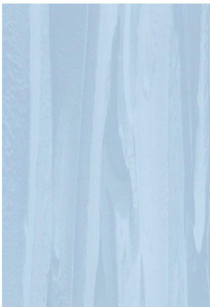
GFD 81108 [Stock] November Skies