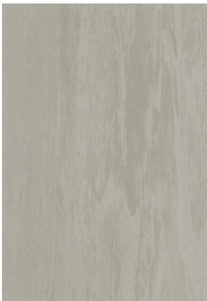
GFD 81114 [Stock] Sandy Hook Gray