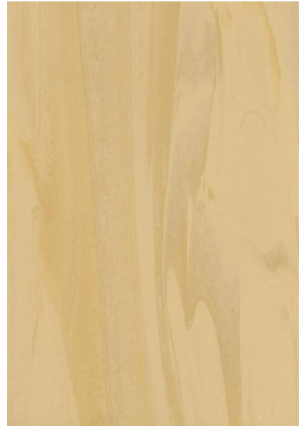
GFD 81121 [Stock] Decatur Buff