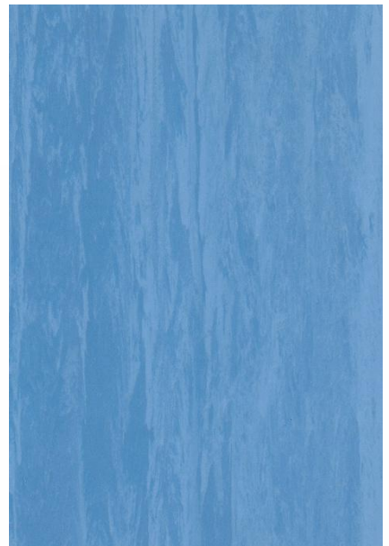
GFD 81106 [Stock] Sailor's Sea Blue