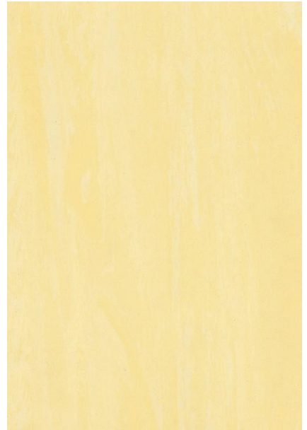
GFD 81103 [Stock] Concord Ivory